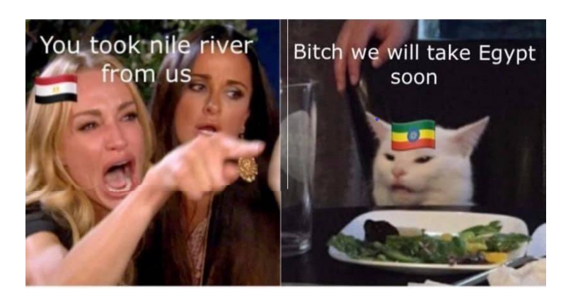
Meme 6: Woman yelling at cat

On the visual level, the postures and facial expressions of the characters in this meme are very indicative. Egypt is represented as a woman who is crying, yelling and pointing fingers rather childishly accusing Ethiopia of taking the River Nile while the other lady attempts to pacify her. Ethiopia, on the other hand, is represented as a cat sitting in a relaxed indifferent manner before a dinner plate.