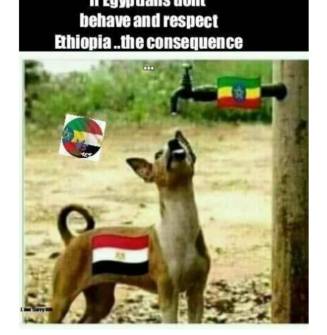
Figure 2 Meme 1: Thirsty dog and tap

The first meme (Figure 2) shows a dog standing with its head raised and mouth opened below a tap from which water is dripping very scarcely. The dog is of a common breed resembling a street dog rather than a special fancy species. The posture of the dog implies that it is very thirty and trying hard to get a drop of water from the tap which is apparently not supplying any water. The flags on the objects in the image are used to assign identity to the participants, with the dog representing Egypt and the tap standing for Ethiopia. The outdoor setting shows muddy landscape in the foreground and some green bushes in the background. The barren land occupying most of the background suggests drought and lack of water. The dog and the tap are the most salient objects in the meme since they represent the two main parties of the conflict.