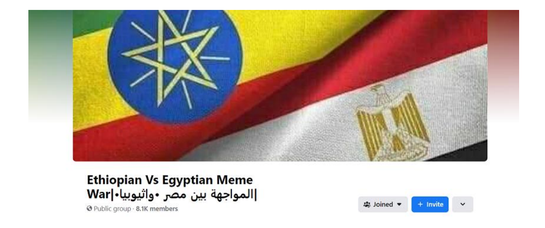
Figure 1 Ethiopian vs. Egyptian Meme War Facebook group

A total of seven memes were selected from the group page as a manageable and purposefully selected sample, with special focus on memes depicting the relationship between Egypt and Ethiopia in relation to the GERD crisis. The chosen memes were posted in 2020 and 2021 by Ethiopian users. Only memes displaying English text were selected.