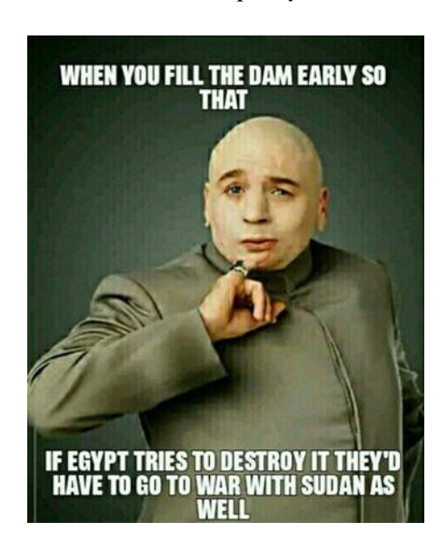
Meme 7: Dr. Evil pinky

The text in this meme is divided into two parts, which is typical of the image macromeme format, with the fist part preceding the image and the second following it. The sentence structure is split accordingly. In this meme, Ethiopians are suggesting that they have managed to put Egypt in a difficult situation by filling the dam early since this will make Egypt obligated to face a confrontation with Sudan. The implication is that in order for Egypt to be able to take military action against Ethiopia, it will have to deploy its forces on Sudanese territory, which is a political fact (Sakr, 2021), thus making it face two enemies instead of one.