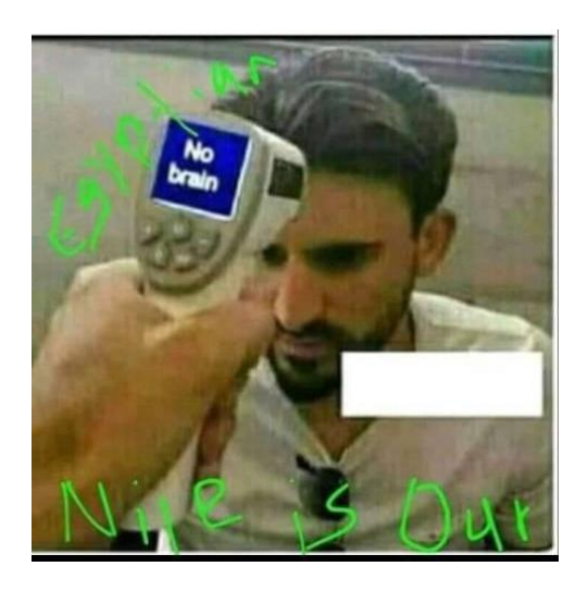
Figure 3 Meme 2: No brain

The meme suggests that Egyptians think they own the Nile, and that this is not true. This is even portrayed as a sick, insane notion from the Ethiopian point of view. The definite article 'the' should have preceded the proper noun 'Nile and the possessive adjective 'our' is used instead of the possessive pronoun, rendering the sentence structure ungrammatical and indicating that it was written by a non-native speaker of English. Still, the main message is delivered suggesting that Egyptians are deluded since the Nile does not belong to them. The use of the possessive form 'our' highlights the conflict of possession.