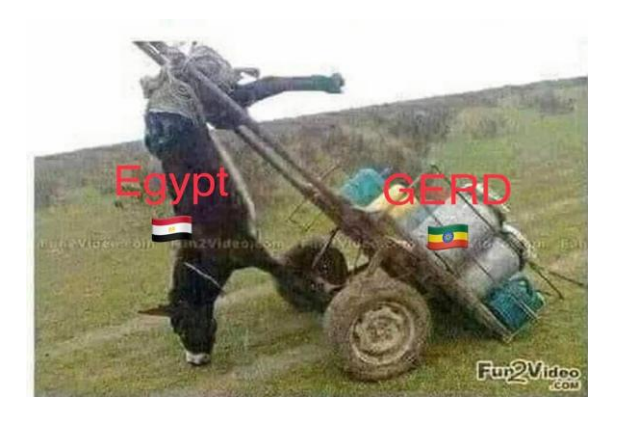
Figure 5 Meme 4: Upside down donkey pulling overloaded cart

The fourth meme (Figure 5) has very little text; only the two words 'Egypt' and 'GERD' are used to point out the entities in the meme, with the former referring to a donkey pulling a heavily loaded cart to which the latter refers. This is further underlined by the use of the country flags on the image. The cart is apparently so heavy that the donkey has lost balance and turned head over heels in a weird looking position. Obviously, it cannot make any movement unless the cart is untied or the weight removed.